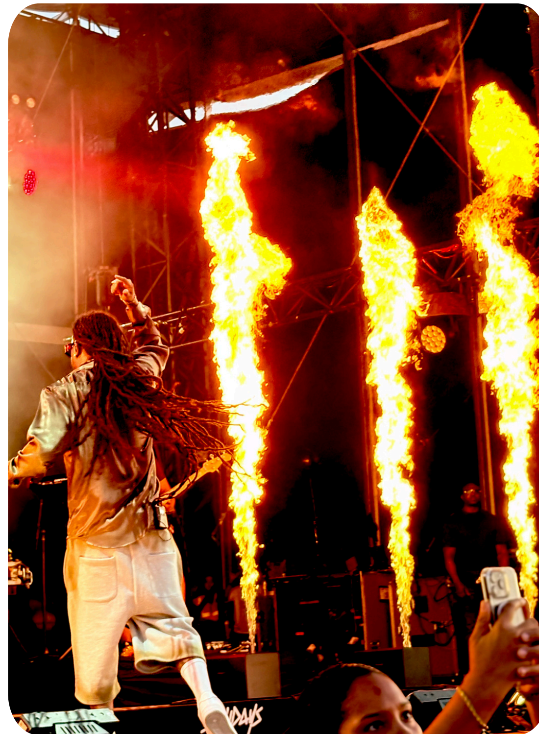
@Kalash - Les Solidays (Paris)