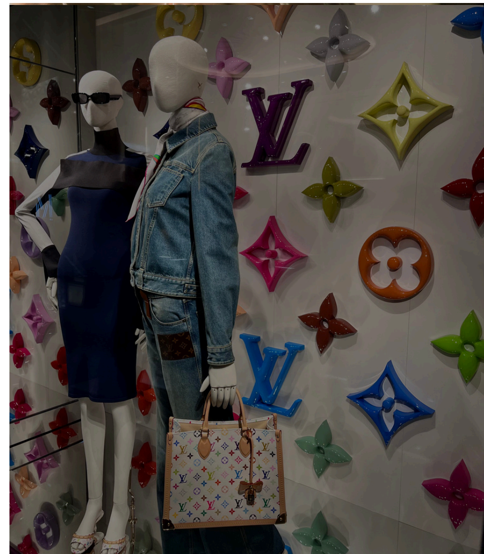
📍 Louis Vuitton Exhibition - Paris

It stands out as my absolute favorite brand, representing a timeless elegance and creativity that I find endlessly inspiring.