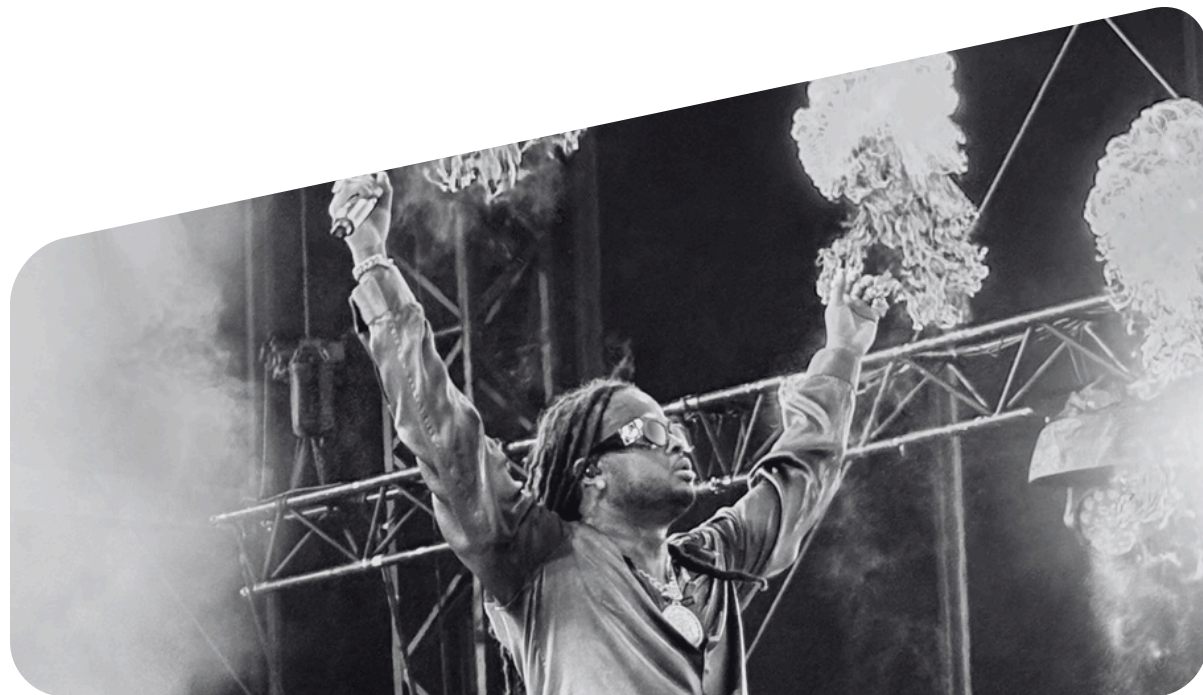
@Kalash - Les Solidays (Paris)

My core focus is event photography, specializing in the dynamic atmospheres of fashion shows, the artistry of the runway, and the vibrant energy of live music concerts. For me, a photograph isn't just an image; it's a story captured in a single frame ”