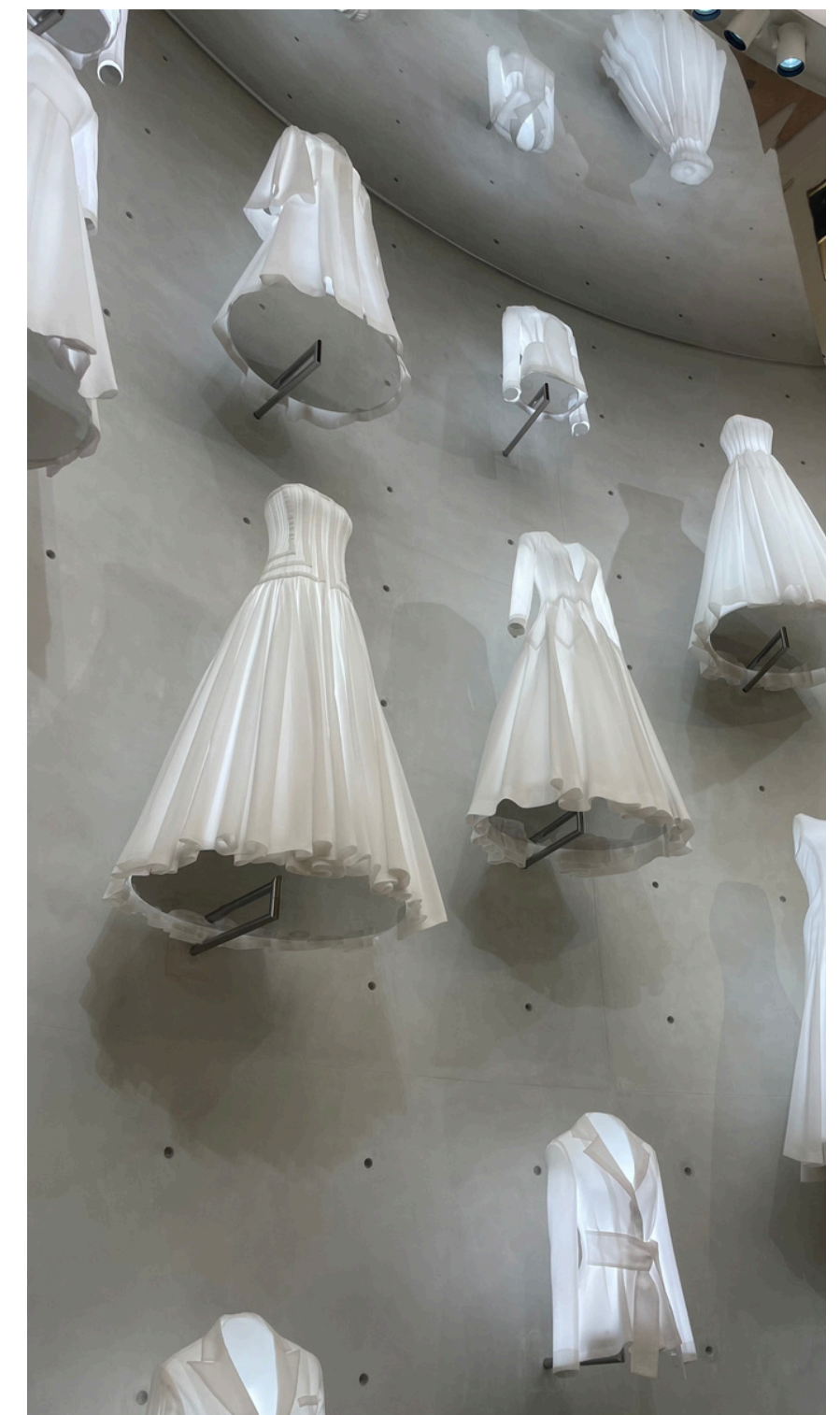
📍 DIOR - Paris