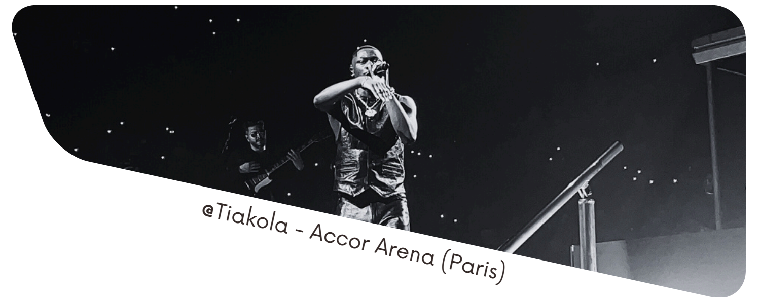
@Tiakola - Accor Arena (Paris)

“ This is where my two passions connect. My studies in web development, graphic design, and digital communication provide the technical skills to support my creative vision. I don't just take the photos; I'm learning to build the websites that host them, design the graphics that promote them, and create the multimedia strategies that make them impactful ”