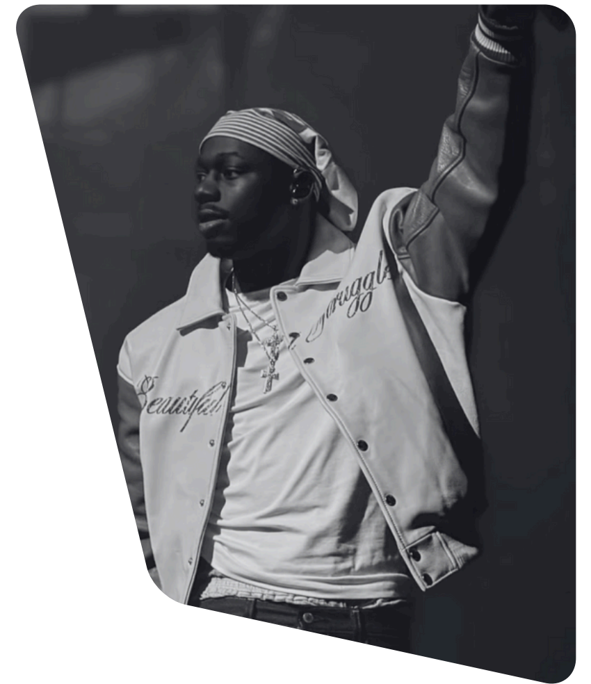
@Tiakola - Zenith (Dijon)

“ My goal is to build a career that merges these two worlds—blending my artistic eye for photography with my technical expertise in digital creation to tell compelling visual stories ”