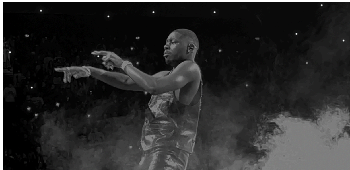
@Tiakola - Accor Arena (Paris)

I have a huge passion for filming live music concerts, particularly those featuring French artists. Capturing the raw energy, the visuals, and the connection between the performer and the audience is an incredible feeling. My absolute favorite artist to film is Tiakola. As a major figure in the French rap and melodic scene, his performances